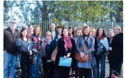
Members of Demonstration Programme in Limerick

The third event was hosted in Limerick by the Southill Area Centre and St. Munchin's Resource Centre, in September and focused on Media & Communications training. The projects also link in regularly via Skype conference calls and this proves very important for continued networking and sharing of information.